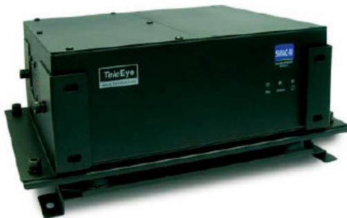
The award-winning TeleEye RX504

Organized by the Hong Kong Electronic Industries Association (HKEIA) and supported by the Hong Kong Trade Development Council, Hong Kong Productivity Council and Hong Kong Science and Technology Park Corporation, HKEIA Award aims to recognize and reward companies that achieve excellence of product design, technology and features. The HKEIA Award was announced and presented during the Asia's largest, and the world's second largest electronics show, Hong Kong Electronics Fair.